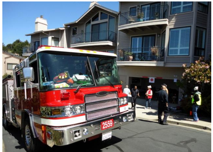
The Oakland Fire Department joins the activities