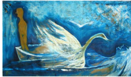
Swan Song by Lawrence Ferlinghetti, 1992

For all the latest information, visit our website: www.hhiv.org