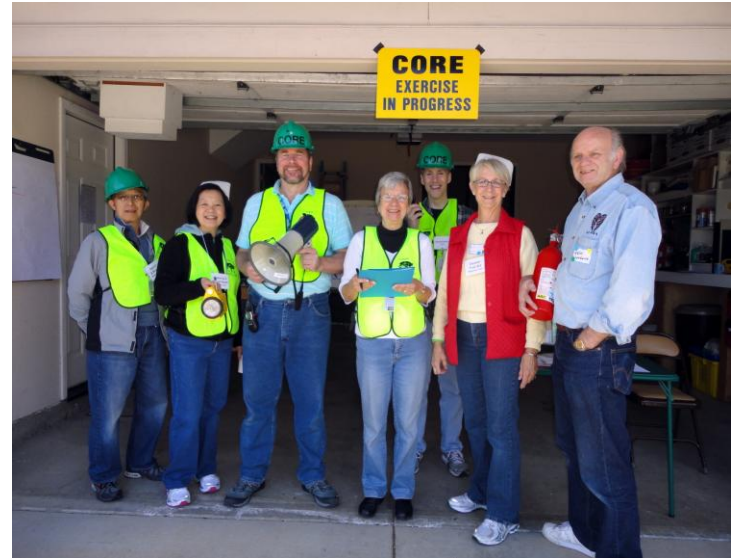
CORE trained exercise facilitators

To date we have received 57 Disaster Preparedness Information Forms . That means that 23 of our homes still haven't returned their form. Please complete the form and leave it in the mailbox at 30 Schooner Hill or the mailbox at 3 Captains Cove.